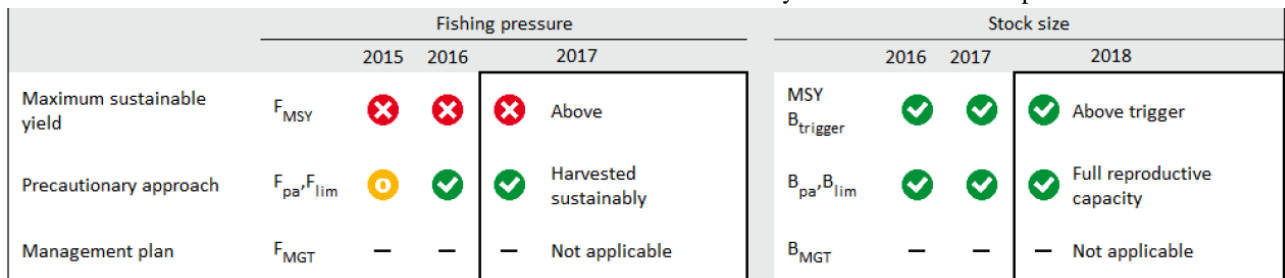
Table 4 Saithe in Division 5.b. State of the stock and fishery relative to reference points. R10

The stock was benchmarked in 2017 and the assessment model and input data were changed. As a result, the historical stock perception has changed markedly. In the assessment SSB tends to be overestimated while F tends to be underestimated. The combination of uncertain survey indices, particularly for recruitment, leads to high uncertainty in the estimates of current SSB and fishing mortality.