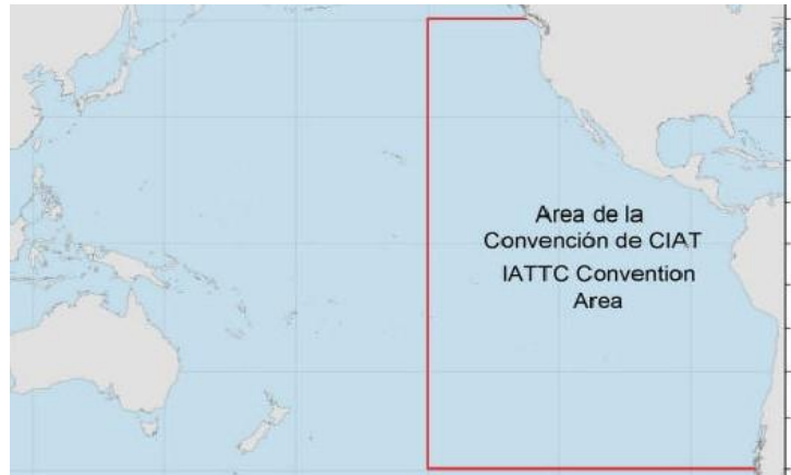
IATTC Convention Area

The Regional Fishery Management Organisation (RFMO) managing the fishery in the assessment area is the Inter-American Tropical Tuna Commission (IATTC). The objective of this RFMO is to ensure the long-term conservation and sustainable use of tuna, tuna-like and other fish species taken by vessels fishing in the Eastern Pacific Ocean (EPO) in accordance with the relevant rules of international law. Recent Resolutions adopted by IATTC include a 2016 Resolution on Harvest Control Rules for Tropical Tuna including Skipjack: