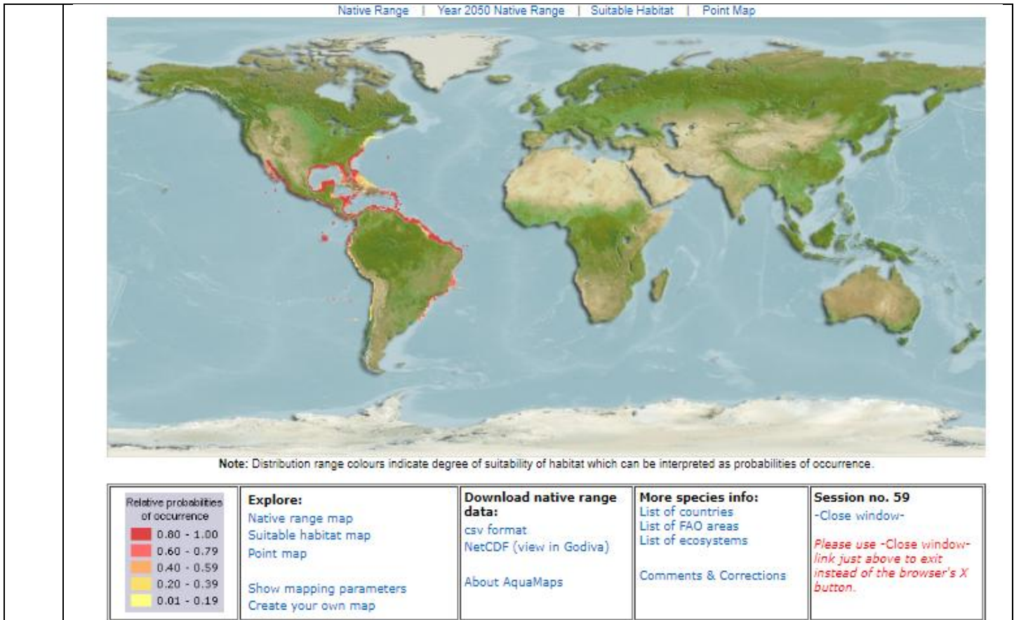
FIGURE 3. Distribution of leatherjackets 2 .