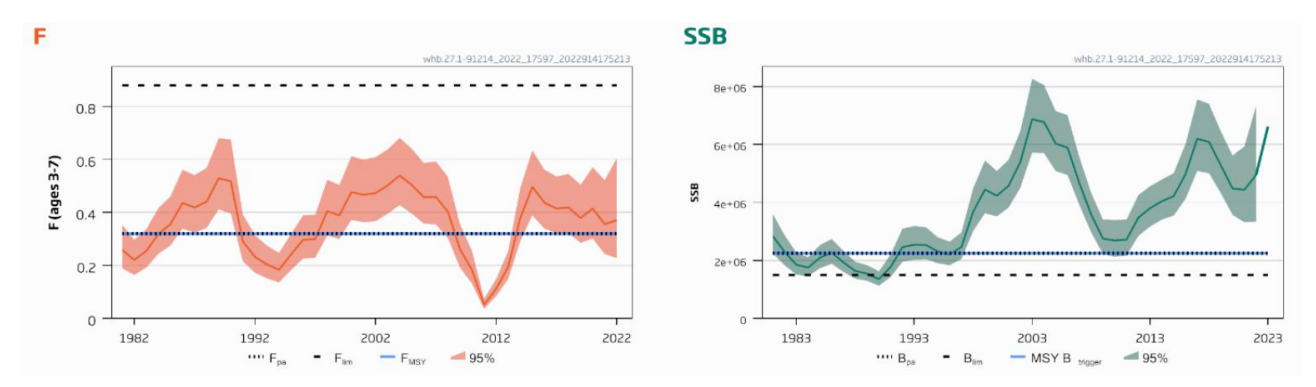
Figure 2. Greenland halibut in ICES subareas 5, 6, 12, and 14 summary of the stock assessment. The left panel shows the historical fishing pressure from 1980 to 2022 and the right panel show historical biomass over the same time period.

Fishing pressure on the stock is above F<sub>MSY</sub> and below F<sub>pa</sub> and F<sub>lim</sub>. Spawning-stock size is above MSY B<sub>trigger</sub>, B<sub>pa</sub>, and B<sub>lim</sub>.