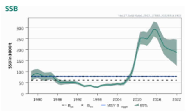
Figure 2. Hake in subareas 4, 6, and 7, and in divisions 3.a, 8.a–b, and 8.d, Northern stock. Summary of the stock assessment. Estimates for SSB are for females only and the 2022 value is a forecast.

Therefore, the species is considered, in its most recent stock assessment, to have a biomass above the limit reference point and it PASSES clause C1.2.