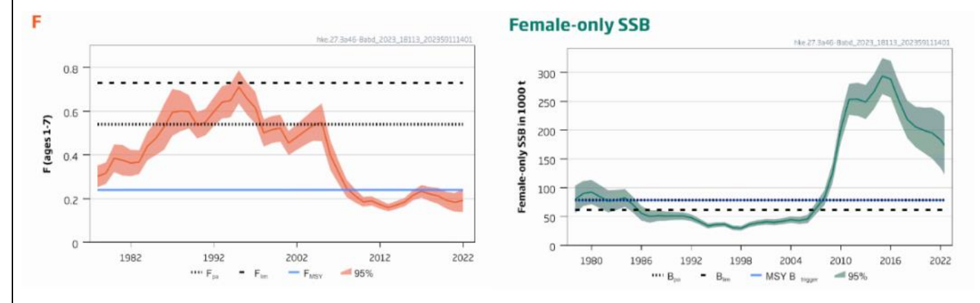
Figure 2. Summary of the stock assessment. Estimates for SSB are for females only.

The management plan target reference point (MAP MSY Btrigger) is set at 72,839 t. The management plan limit reference point (MAP Blim) is set at 61,563t. SSB in 2024 was projected to be 147,7052t, considerably higher than the target and limit reference points.