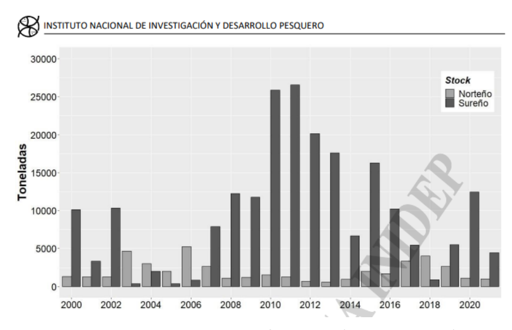
Figure 1. Atlantic chub mackerel landings in tons for this stock (Orlando et al. 2022).

The last stock assessment was publish in 2021 by the Instituto Nacional de Investigación y Desarrollo Pesquero (INIDEP) using an age-structured production model, where catches data are considered for the analysis (Orlando et al. 2021). Landings data are reported each year and used also for population parameters analysis (Orlando et al. 2022)(Figure 1).