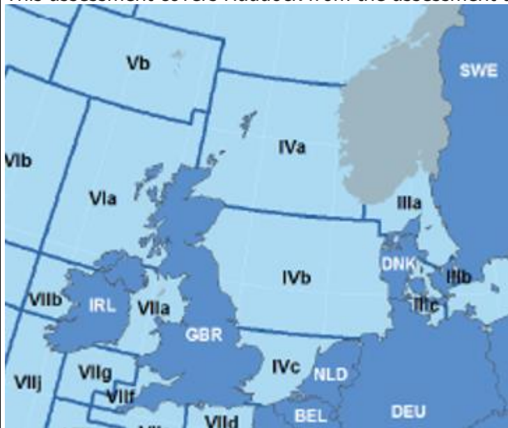
Figure 1: Haddock in the assessment area VIIa Irish Sea R1

This assessment covers Haddock from the assessment area ( Figure 1 ):