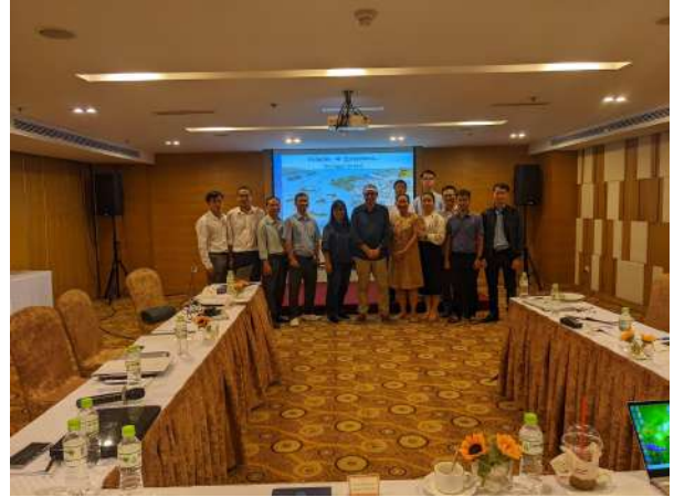
Training about MarinTrust standard version 2 17-18/8/22