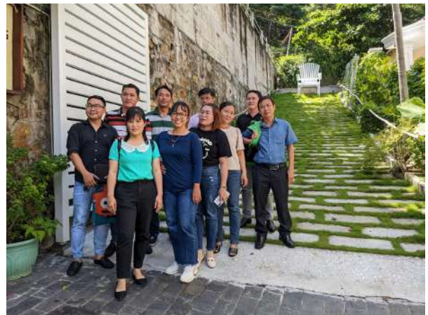
The first site to have MarinTrust IP assessment