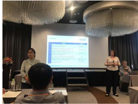
Meeting with MarinTrust 29/7/22