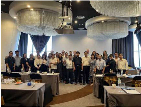
FIP partner meeting 29/7/22